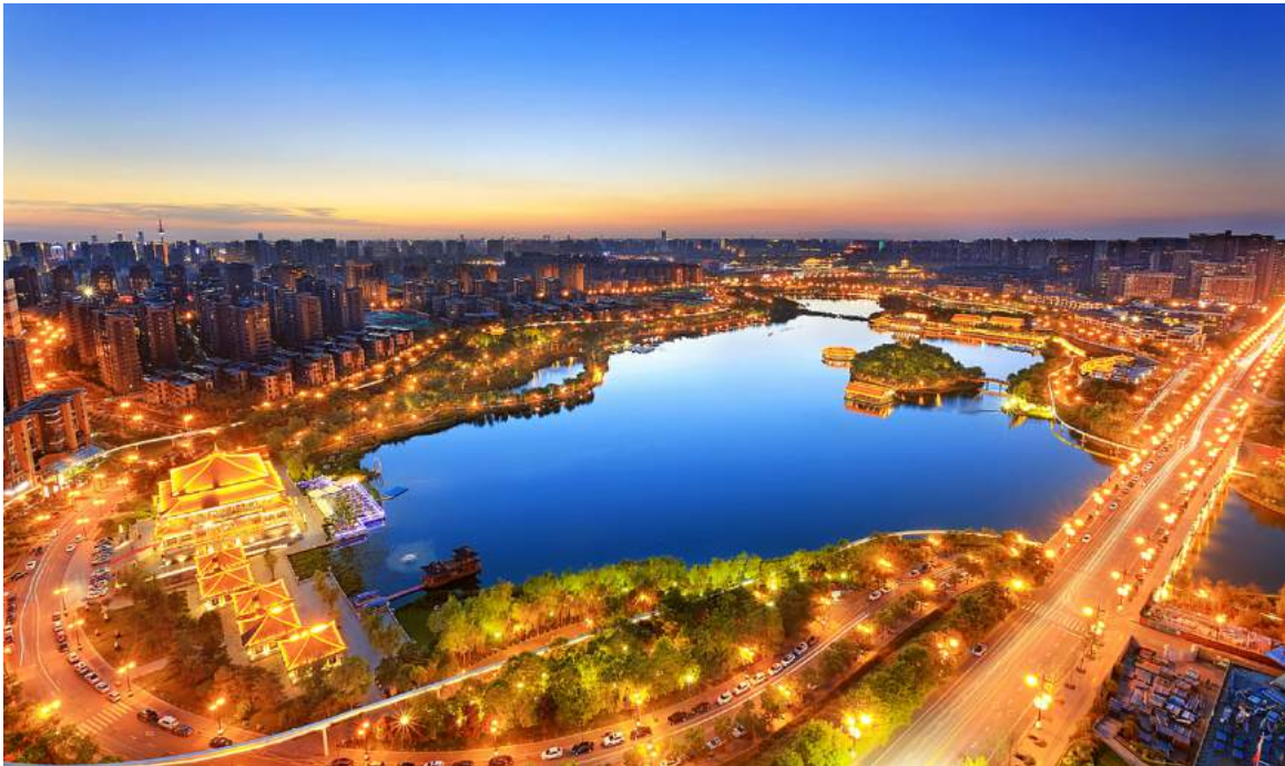
Figure 1: Qujiang Park

Amongst all Chinese cities, Xi'an is ranked third behind Beijing and Shanghai with regard to the number of science and technology research institutions and military enterprises.