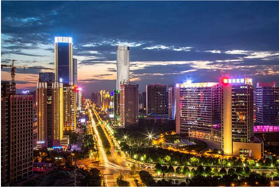
Figure 2: the Xi'an High-Tech Zone