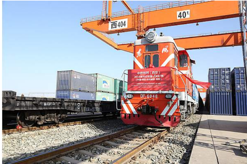
Figure 4: Xi'an International Trade and Logistic Park

The park has set up an efficient transportation system featuring rivers, air transport, railways and highways reinforced by the logistics center of the Xi'an Railway Container Freight Station, the Xi'an Comprehensive Free Trade Zone and the Xi'an Highway Port. It seeks to become the largest international inland port in China and the most important logistics hub in the upper and middle reaches of the Yellow River, as well as a modern city driven by the service industry. It also plans to develop into an influential international inland port in China for domestic and international markets, improving the investment environment and setting up a solid platform for transfer of industrial output from China's eastern coastal area to the world.